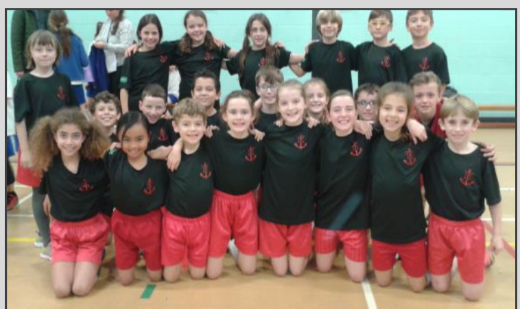
Our winning Athletics Team!