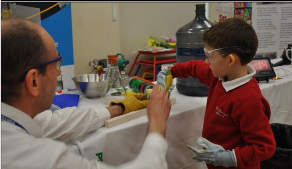
Reception children were being STEM ambassadors and tried their own experiments in class!