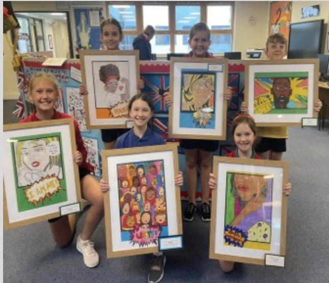
Our proud artists with their art masterpieces!